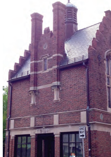
Lampoon Building, Harvard University