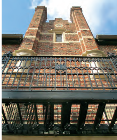
Hand-crafted Fire Escape &amp; Handrail