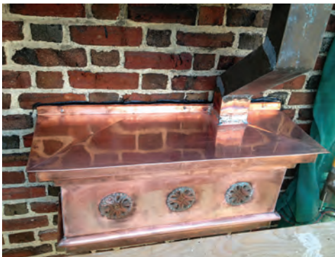
Decorative Copper Hand-crafted Leader Box

A notable challenge during the project was the design and installation of a new solid mahogany egress door with a custom fabricated limestone surround that seamlessly matched with the existing limestone. Cenaxo was able to successfully complete this project by putting together the right team of design professionals, project managers and craftsmen.