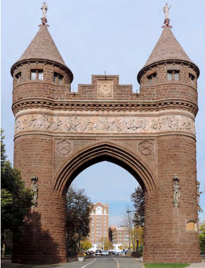
Soldiers and Sailors Memorial Arch